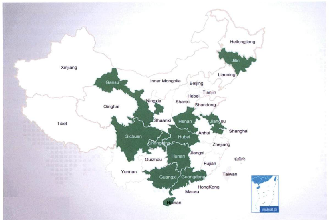
Figure 1: Geographical Distribution of Allocated Green Projects

ADBC plans to use proceeds while following the GBP. Funded projects are classified into three categories: sustainable water and wastewater management, environmentally